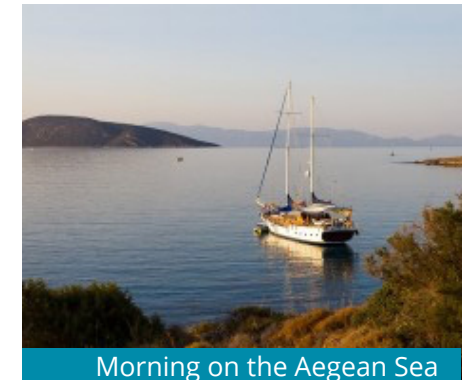
Morning on the Aegean Sea