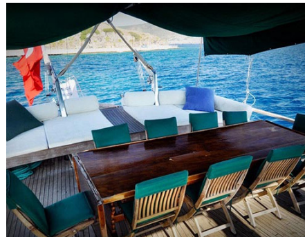
Dine under the stars