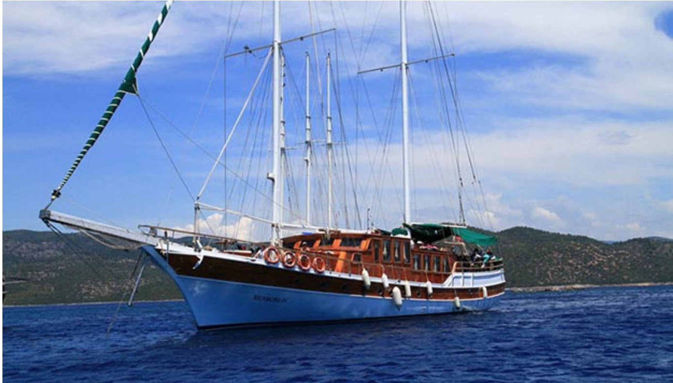
Standard Plus gulet