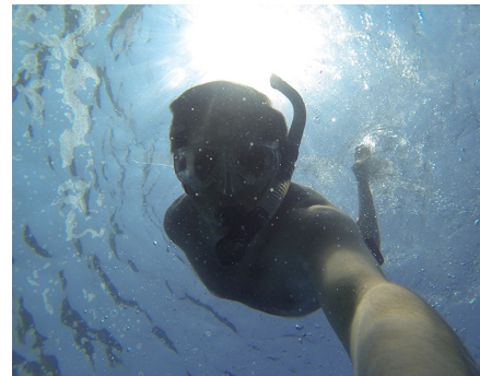
Snorkel the clear waters